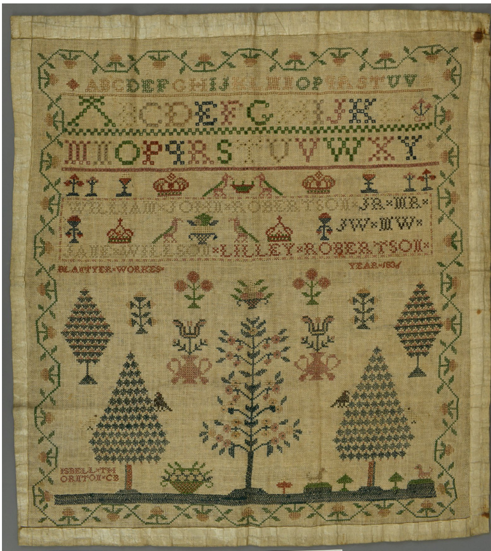
Embroidery sampler

Do you think it would have been different for David's sisters? Below is an embroidery sampler made by a girl who worked at Blantyre Works. Can you see her name and the year it was made?