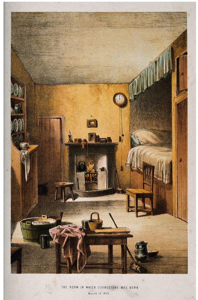
THE ROOM IN WHICH LIVINGSTONE WAS BORN March 19 1813. The room where David Livingstone was born. Lithograph.

How many hours are left over for each of you? What would these hours be spent on?